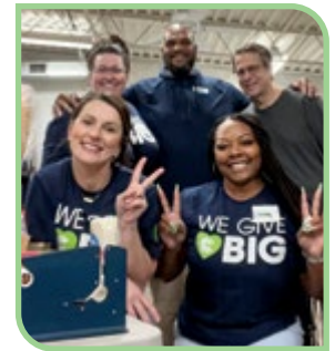
CARES of Farmington Hills