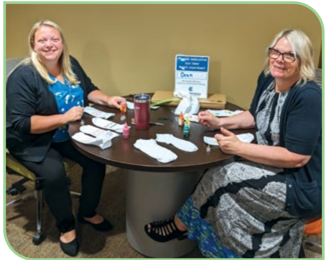
Kids Food Basket lunch bag decorating