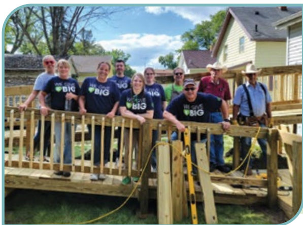
Jackson member center partnering to build a wheelchair ramp.