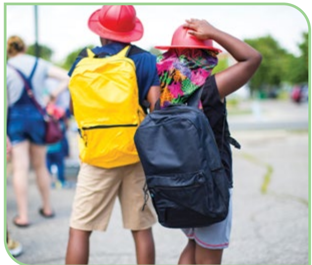
Backpack Giveaway Event

3,200 new backpacks were distributed across 8 communities for kids headed back to school.