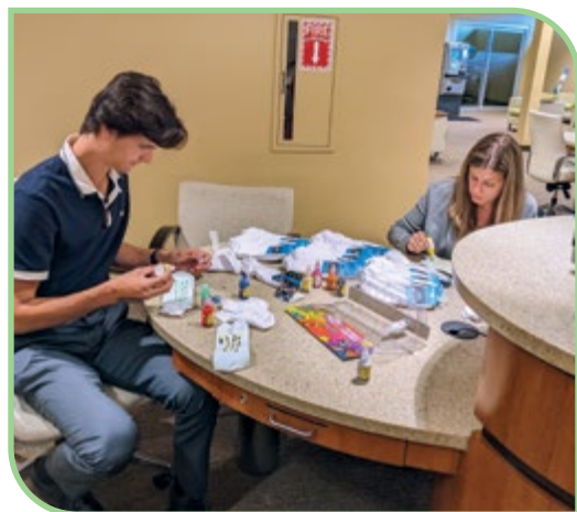
Volunteers decorating Kids Food Basket lunch bags