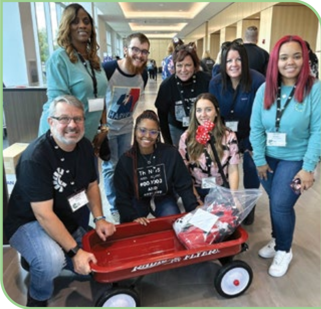
Team Enrichment Day 2023

Community Choice Credit Union team members built 65 Radio Flyer wagons along with comfort bags to support children in need.