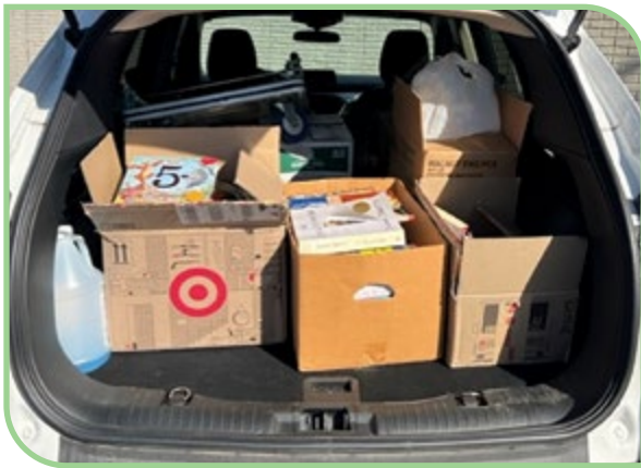
Community Choice Book Drive

All 24 Community Choice Credit Union locations hosted a book drive supporting Friends of the Library groups across Michigan.